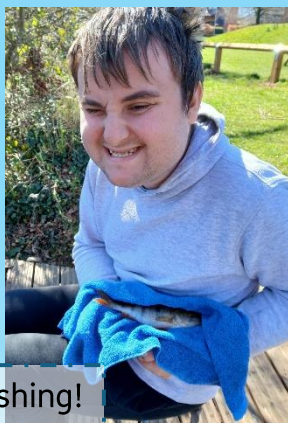
A spot of fishing!