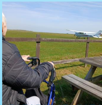
A trip to Old Buckenham Airfield Museum

Practicing PAT testing during volunteering at PACT charity shop