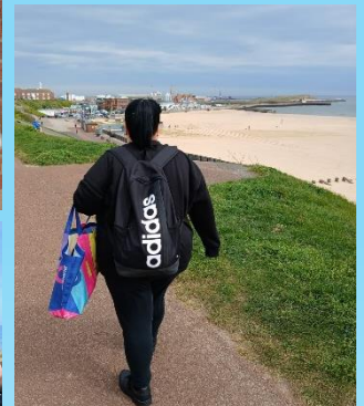
A day out in Gorleston