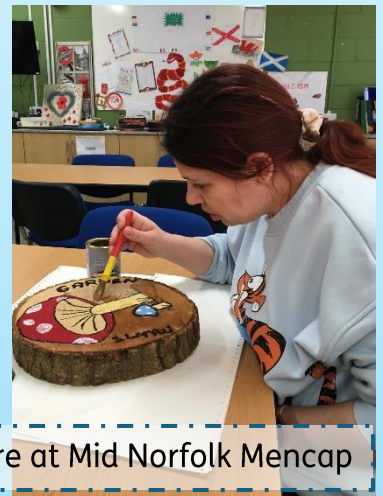
Cooking, baking, and arts & crafts here at Mid Norfolk Mencap